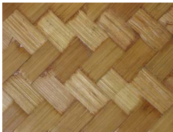
Close-up of the woven mat

Bamboo handicrafts from Tripura are immensely popular throughout India and form a sizeable chunk of the rural economy. Tripura is famous for its bamboo screens made from split bamboo, so finely woven that they look almost like ivory. Bamboo matting is another thriving industry in the state. The bamboo sector also supports industries that produce paper and incense sticks ( agarbatti ).