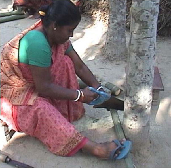
Cross-cutting the bamboo pole

which accrues to the household enterprise, as the labour is contributed by household members. The actual earning, therefore, is much more than the INR 0.79 per mat shown as net profit.