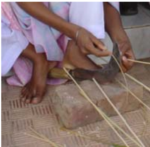
Slivering of bamboo slats

140 km away from Agartala. The total length of railway track from Dharmanaga))facturing sector (6.41 percent of workforce engaged) lagging far behind. About 66.8 percent of the rural people are under the poverty line.